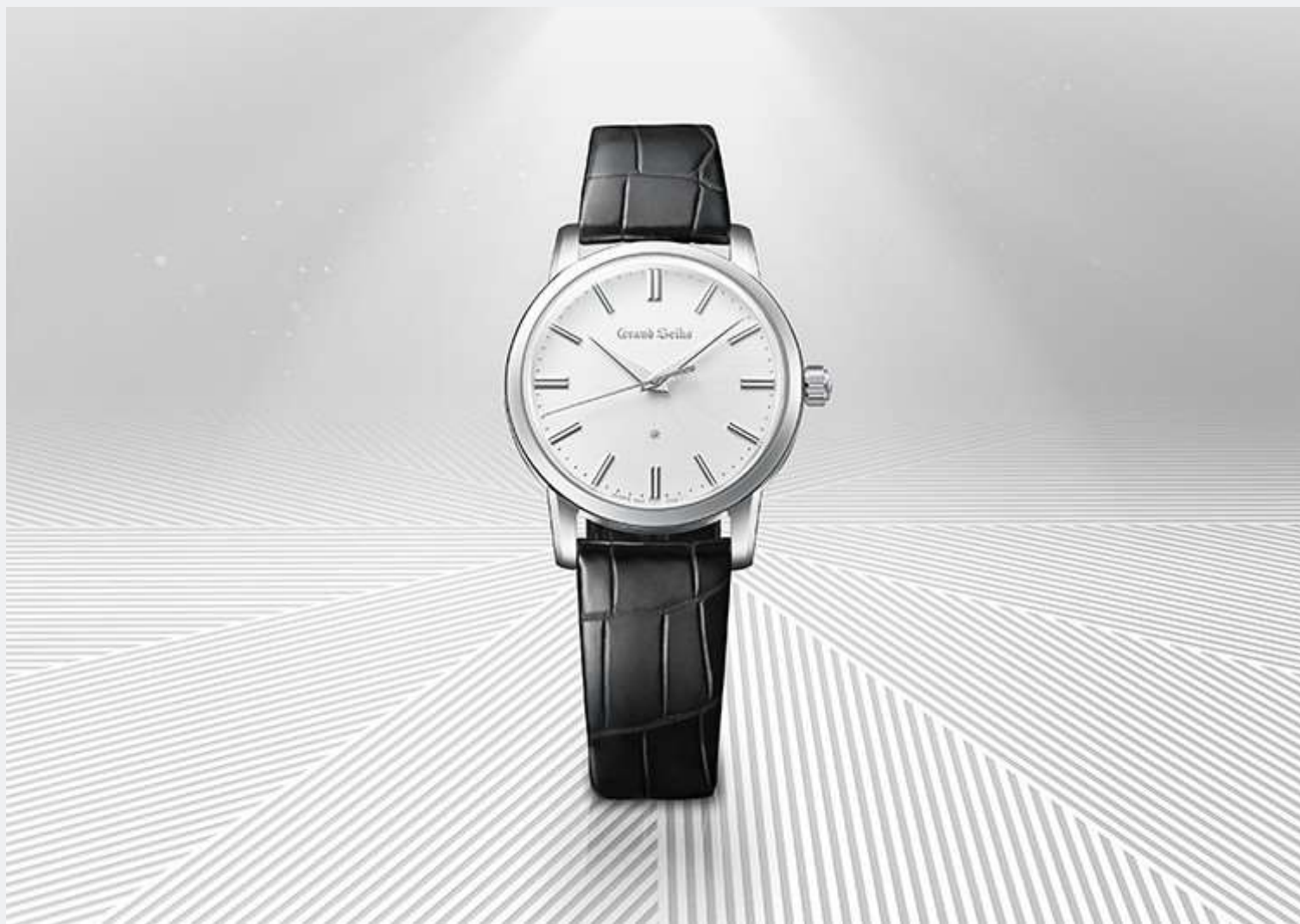
The Kintaro Hattori 160th Anniversary Limited Edition.

Seiko's founder Kintaro Hattori was born in central Tokyo in 1860 at a time in Japanese history characterized by rapid modernization and westernization. The young entrepreneur saw the sudden and momentous changes in Japanese life as a moment of opportunity. In 1881, at the age of just 21, he set up his own company, "K. Hattori", to wholesale and retail imported timepieces and, just twelve years later, he established a factory which he called Seikosha, 'The house of precision', to produce his own clocks and, later, watches. His aim was for Seikosha to be able to manufacture and assemble all the components for its timepieces in-house by mastering every aspect of the horological art. Step by careful step under Kintaro's leadership, the company achieved his aim. Its long list of watchmaking innovations down the decades bears testament to his remarkable vision and continues to inspire it to this day.